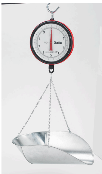
Shown with optional CG Scoop